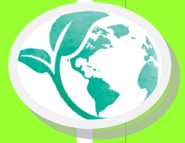
Fig Tree International Ltd