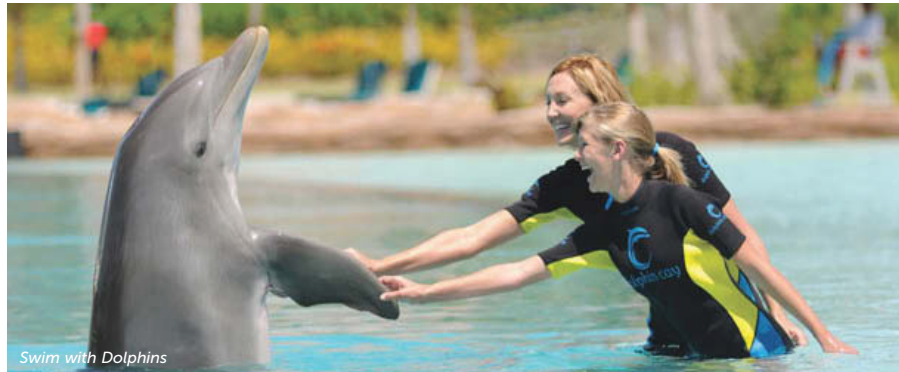
Swim with Dolphins

Get a full listing of family activities at ncl.com/family