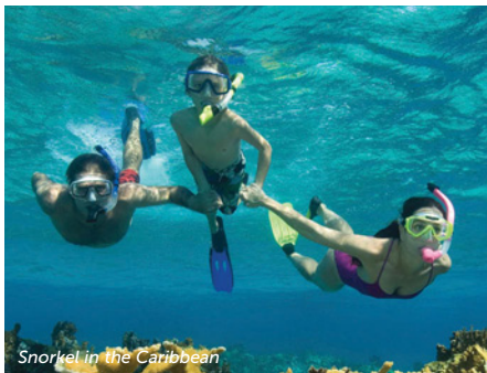
Snorkel in the Caribbean

Call up sunny weather and swaying palm trees anytime you like. It's easy on Norwegian with convenient year-round departures from New York City and from Boston in the fall. Unpack once and experience a vacation packed with all the activities, shows and entertainment you want, along with a week (or two) of tropical breezes, white sands and inviting blue waters. Along the way, spend the day in Orlando's theme parks. Explore the exotic marine life and colorful coral reefs in a glass-bottom kayak in Nassau. And the fun doesn't stop there. Splash down the world's largest inflatable water slide while you bask in the warm tropical sun on Great Stirrup Cay, our private island in the Bahamas.