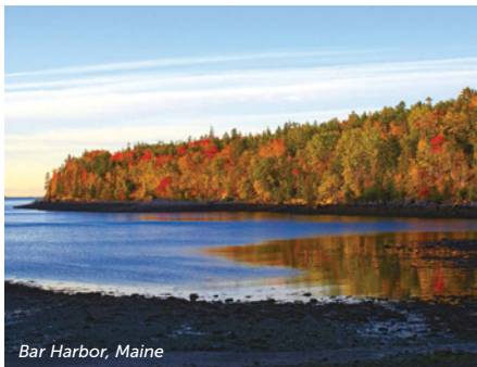
Bar Harbor, Maine

Along the coastline of Canada & New England is where the deep-blue sea meets rich autumn hues. Take it all in—and your digital camera out—as you witness the changing fall foliage, one of nature’s amazing spectacles. It’s also where you’ll travel back to the Gilded Age and explore Bar Harbor, an opulent summer retreat built for the 19th-century elite. Québec City’s iconic Château Frontenac is where you’ll find the best views of the Saint Lawrence River. At low tide, hike down to the base of New Brunswick’s Hopewell Rocks, a marvel of nature created by melting glaciers and carved by the highest tides in the world. And save an afternoon for a true “downeast” lobster bake with fresh-from-the-ocean lobster drizzled with butter and all the trimmings.