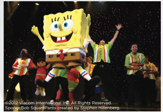
©2012 Viacom International Inc. All Rights Reserved. SpongeBob SquarePants created by Stephen Hillenberg.