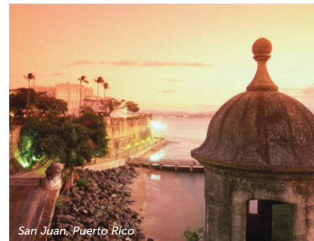
San Juan, Puerto Rico

Learn more about our exciting port adventures at NCL.com/greatstirrupcay & ncl.com/bahamas