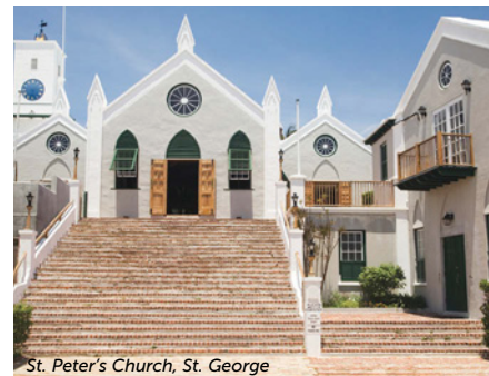
St. Peter's Church, St. George