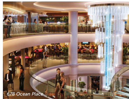
678 Ocean Place

From the expected. From the ordinary. Introducing Norwegian Breakaway, a ship designed to connect you with the ocean and bring to life the allure and romance of traveling on the sea. Eight decks above the water and worlds away from anything you've ever seen, The Waterfront is where you'll feel the ocean breeze on your skin and taste the salt air as you explore all kinds of shops, restaurants and bars along a quarter-mile, wrap-around oceanfront boardwalk. And at 678 Ocean Place, the heart of Norwegian Breakaway, discover three captivating, wide-open decks of daytime and nighttime entertainment where unique indoor spaces flow seamlessly outdoor like never before. The largest cruise ship to ever homeport in New York City, Norwegian Breakaway sets sail in the spring of 2013. We invite you to step aboard to be one with the ocean and a part of cruising history.