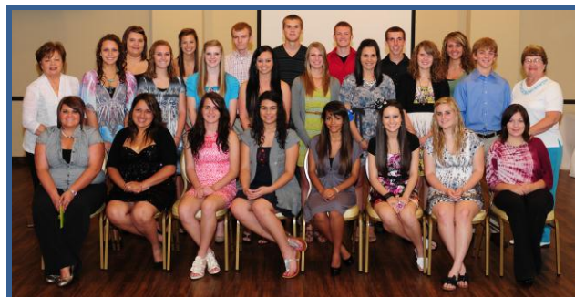
Scholarship Luncheon May 24 th at Best Western