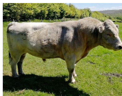
Parton Hi-Flyer 849