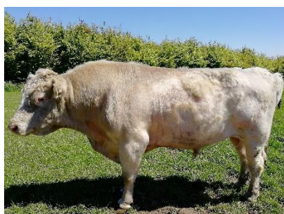
Parton Hitman 847

2 x 5 year old, 1 x 8 year old. Proven and sound feet