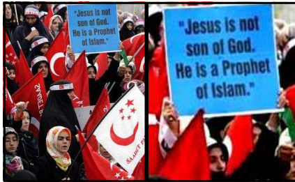
Muslims gathered in protest against the Vatican over remarks made by the pope—2006.

There is only ONE TRUTH that the world needs to know about Islam and its followers : they DENY that Jesus Christ is the Son of God .