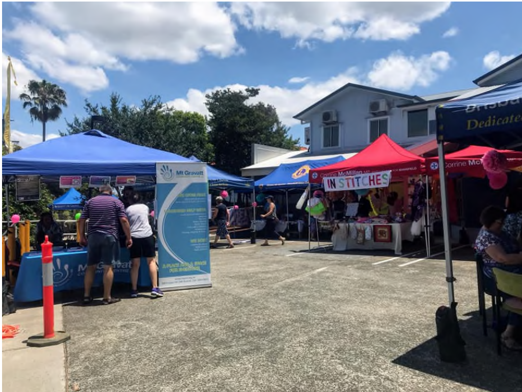
Stalls at Mt Gravatt Community Centre's Wellbeing Fete.