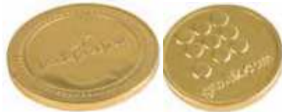
Milk chocolate coins