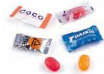
Flow pack candy