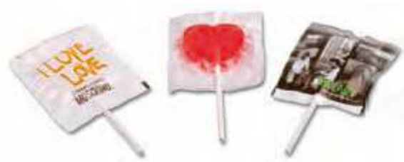
Big flat lollipop. Round or heart shape