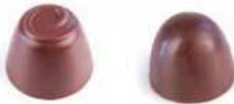
Single twist chocolate