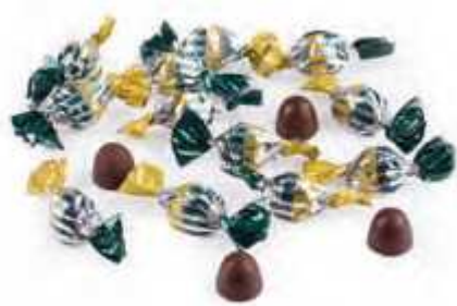
Double twist mini chocolate