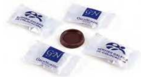
Flow pack Neapolitan