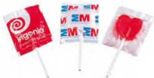
Medium flat lollipop. Round or heart shape