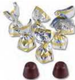
Single twist chocolate