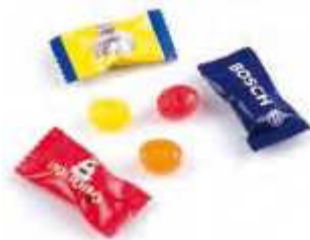
Flow pack mini candy