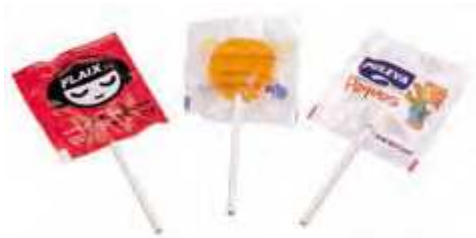
Small flat lollipop. Round or heart shape