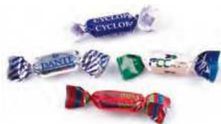
Double twist mini rectangular candy