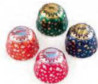
Chocolate with a liquor filling