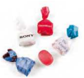
Single twist candy