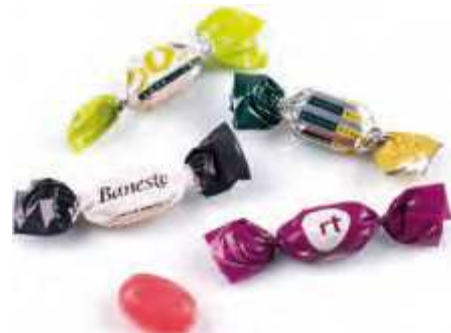
Double twist candy