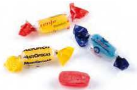
Pectin soft candy