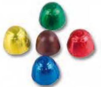
Assorted mini chocolate