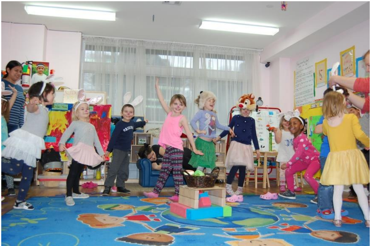
Musical play “Bear Snores On”