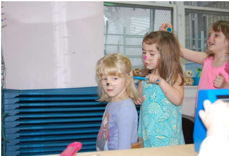
Playing Hair Salon

If a child brings a prohibited item to camp, the item will be taken away and returned to his/her parent at the end of the day. These items are prohibited in order to eliminate any disruption or safety concern that may arise from their use.