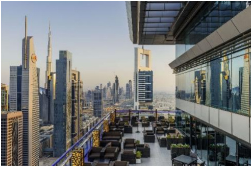
Sheraton's Deck 43 rd floor