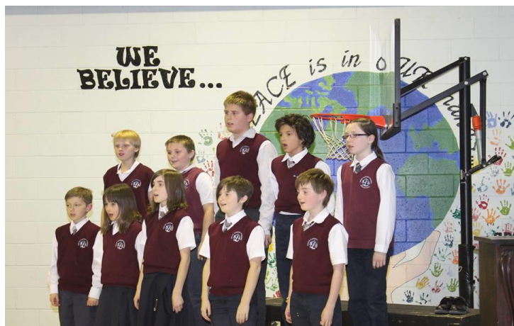
SLA Junior Choir perform, "Simple Song" at the Open House

Thank you to all of the teachers who supplied all snacks and beverages.