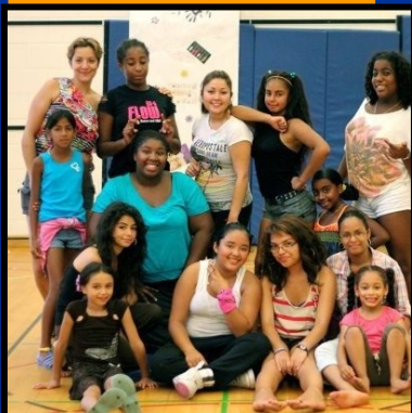
Summer Camp Participants 2011