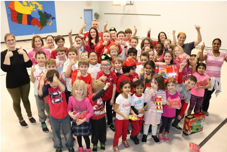
SLA Students celebrate reaching our lofty goal of $2500.00 for Heart & Stroke Research

To complete the Valentines Day celebrations, SLA students showed their love for Canada's Veterans by creating over 240 Valentine's cards to be delivered to veterans living in retirement facilities around the country.