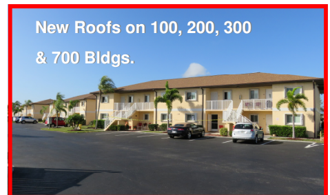
New Roofs on 100, 200, 300 & 700 Bldgs.