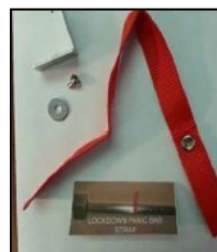
Lockdown panic bar strap