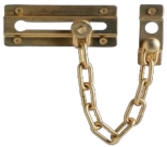
Locking door chain

These types of locks and latches are prohibited and do not meet current fire code.