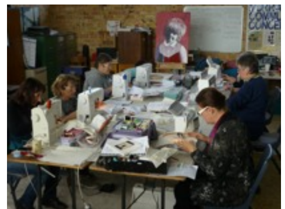
Freehand machine embroidery for beginners at Murray Bridge