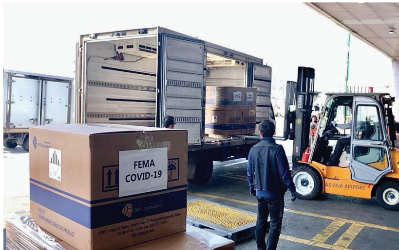
FEMA Logistics Staff coordinate the transportation of COVID-19 test kits arriving through Project Airbridge on April 14, 2020.

FEMA has prepared for hurricane season and other emergent incidents by aligning resources, awarding contracts, and readying Logistics personnel for rapid response operations. In addition to owning and purchasing resources, FEMA also has multiple partnerships with other federal agencies such as the U.S. Army Corps of Engineers, the Defense Logistics Agency, and NGOs such as the American Red Cross.