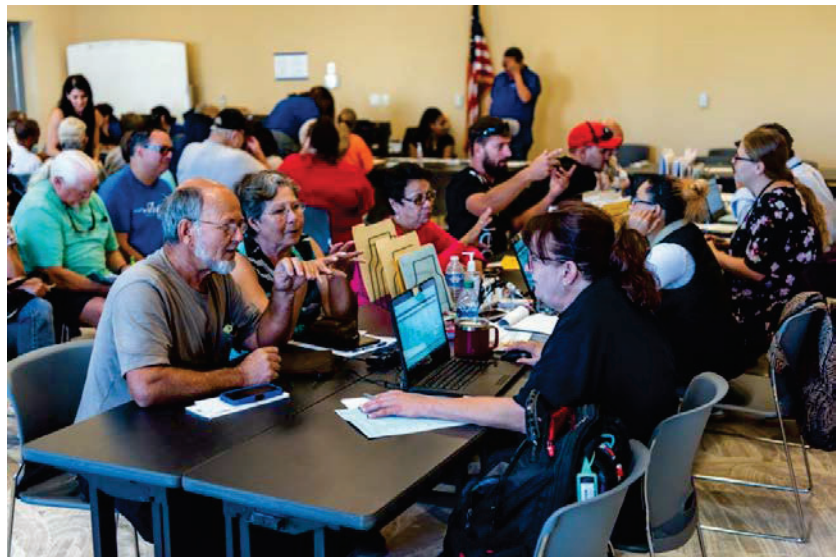
FEMA personnel and disaster survivors at a DRC during Hurricane Michael depicts limited potential for social distancing measures using standard facility footprints.

FEMA, in coordination with SLTT partners, will determine the use of Disaster Recovery Centers (DRC) or Disaster Survivor Assistance (DSA) teams according to the phased reopening of an impacted area. In areas with limited field presence, FEMA will use online and phone registration and virtual assessments to ensure program delivery. If phone lines are down, FEMA will prioritize stabilizing the communication lifeline in order to restore networks and support registration processes. FEMA will also coordinate with federal and voluntary agency partners