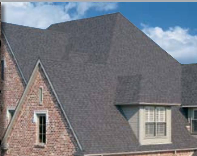
WEATHERED WOOD † CLASSIC HERITAGE COLORS