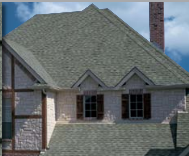
OXFORD GREY † CLASSIC HERITAGE COLORS