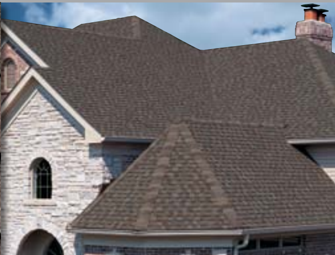
NATURAL TIMBER AMERICA'S NATURAL COLORS