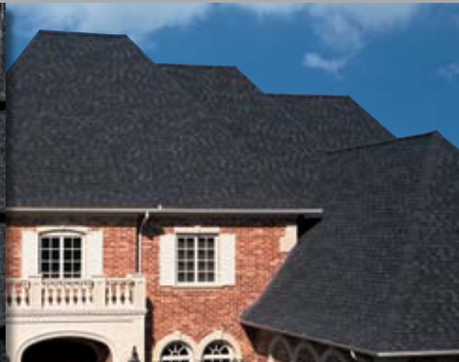
RUSTIC BLACK † CLASSIC HERITAGE COLORS