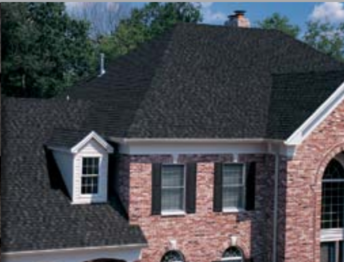
BLACK WALNUT AMERICA'S NATURAL COLORS