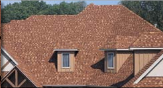
HARVEST GOLD AMERICA'S NATURAL COLORS®