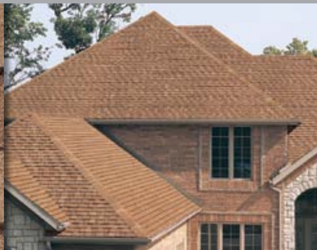
RUSTIC CEDAR CLASSIC HERITAGE COLORS