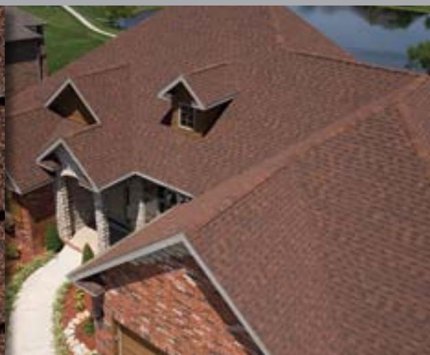
RUSTIC HICKORY † • CLASSIC HERITAGE COLORS