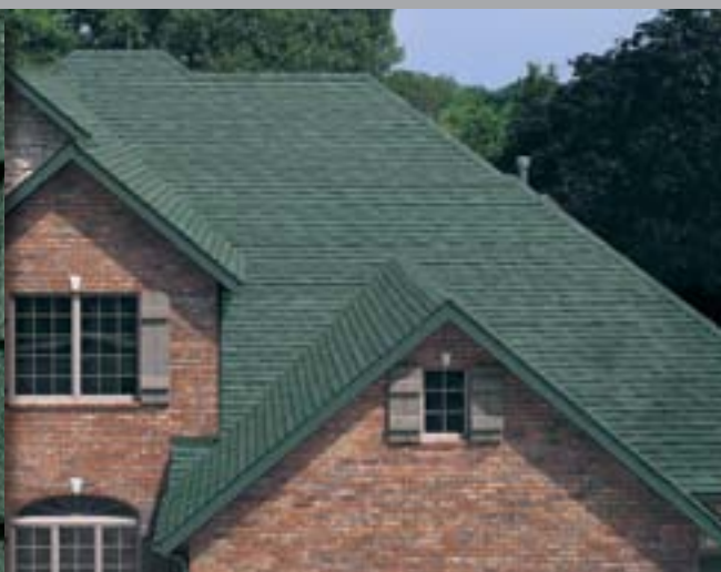
RUSTIC EVERGREEN † CLASSIC HERITAGE COLORS