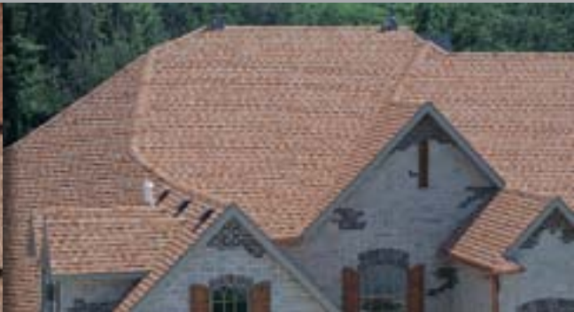
PAINTED DESERT • AMERICA'S NATURAL COLORS