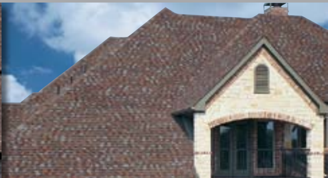
MOUNTAIN SLATE AMERICA'S NATURAL COLORS