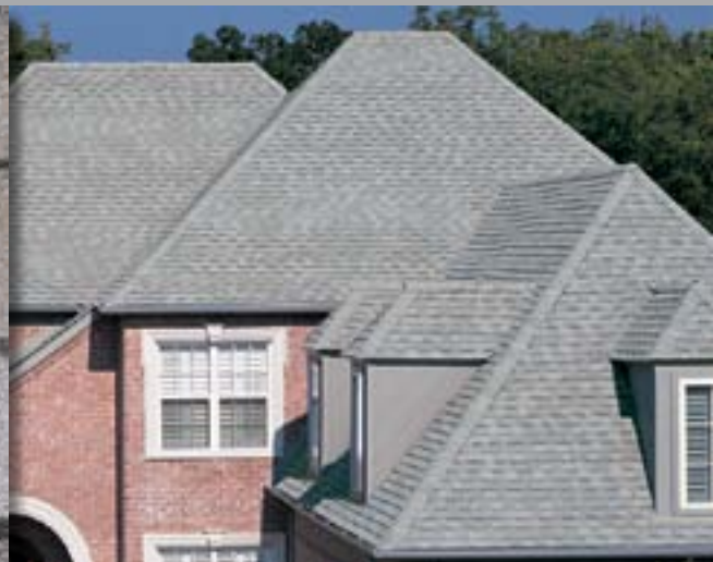
OLDE ENGLISH PEWTER CLASSIC HERITAGE COLORS