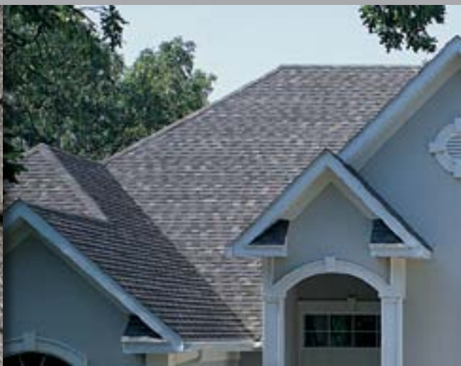
ANTIQUE SLATE † CLASSIC HERITAGE COLORS