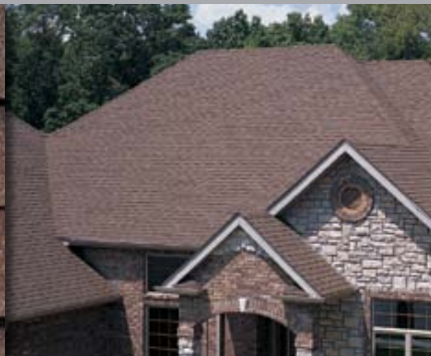
RUSTIC SLATE CLASSIC HERITAGE COLORS