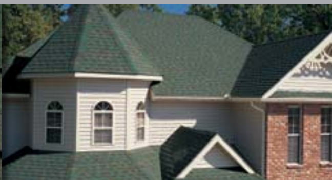
FOREST GREEN • AMERICA'S NATURAL COLORS