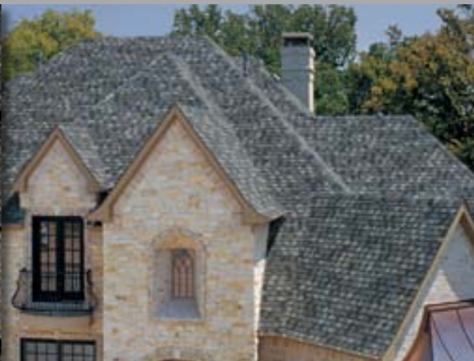
THUNDERSTORM GREY AMERICA'S NATURAL COLORS®