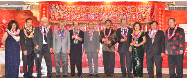
Current and Past SDDS Presidents.