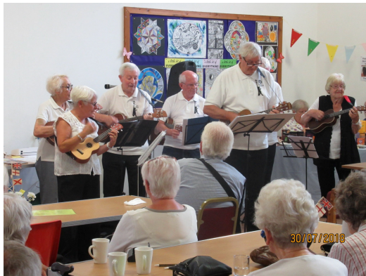
Musical moments entertained us

More than 70 people came each day and everything was free except the day trip. We will be holding a similar event next year so why not give it a try!