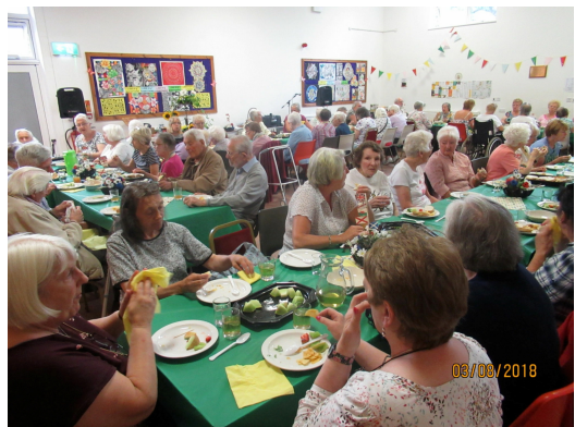
Delicious meals were provided

St Margaret's Church, 250 Burnage Lane, Burnage, Manchester, M19 1FL Office: 0161 432 4606 Email: info@stmargaretsburnage.org.uk