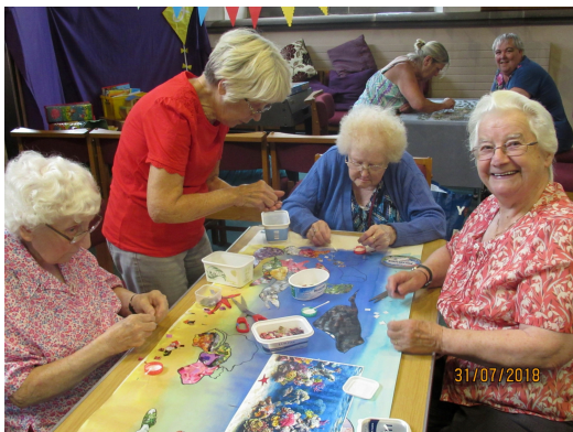
Crafts and games were enjoyed