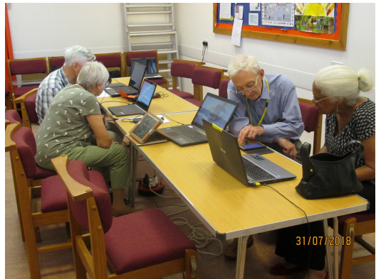
Technological support was given