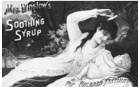
An ad for Mrs. Winslow's Soothing Syrup, an opium-based product to be given to infants suffering teething pain