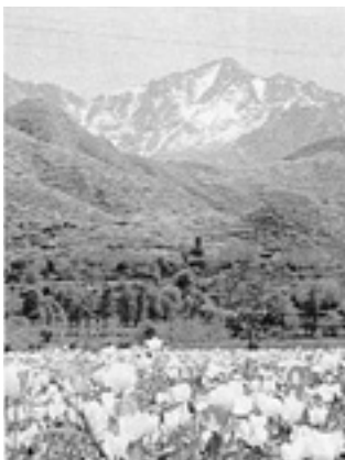
A poppy field in Southeast Asia

Living within an agrarian society, the Sumerians grew barley, dates, and grain as their primary crops. They also grew the opium poppy, Papaver somniferum . The cereal crops came in the spring and were used to feed sheep and cattle during the hot summer months. The dates came in the