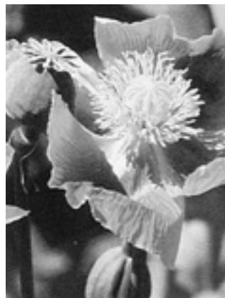
Papaver somniferum , the opium poppy