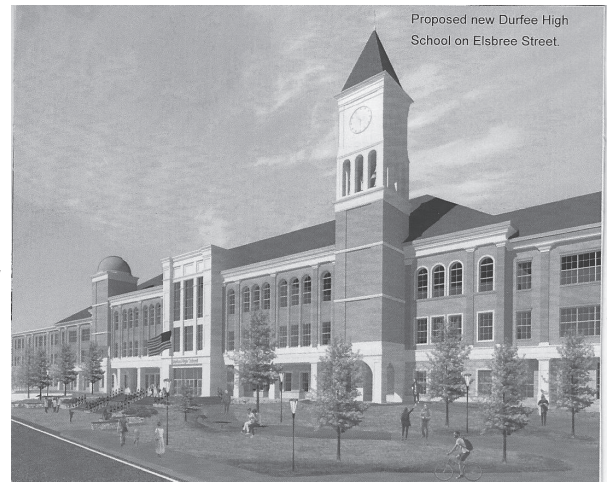
Proposed new Durfee High School on Elsbree Street.

https://www.fallriverschools.org/durfee/durfee-links/new-durfee-project-info