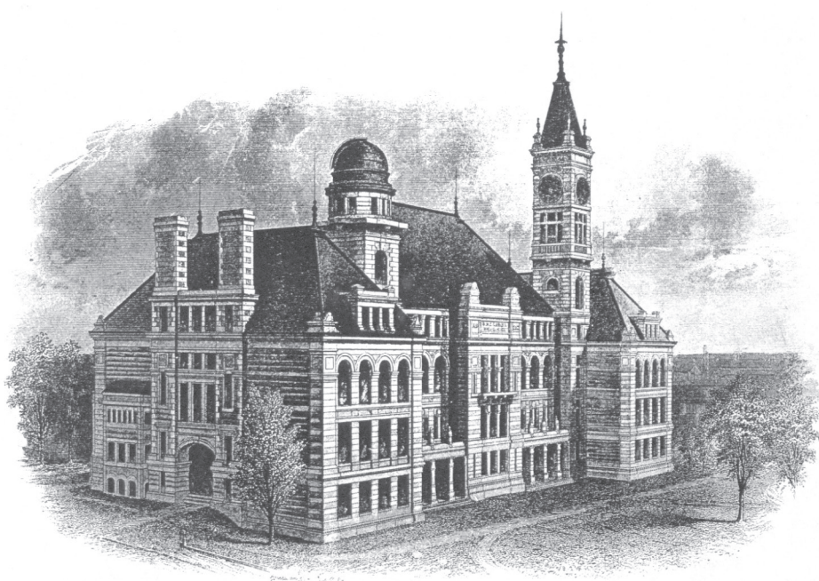
B. M. C. Durfee High School, Fall River, Mass. DEDICATED JUNE 15, 1887

Raise our praises high to Durfee, Alma Mater dear. Tow'ring high beside the river, Radiant beacon clear.