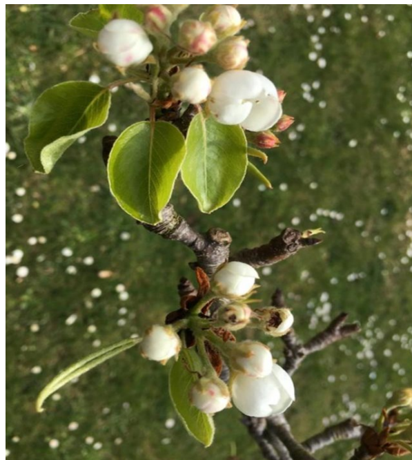
Peartree blossom from the church garden