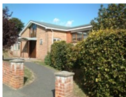
St. Patrick's Church

Broad Green/Cowley Drive Woodingdean BN2 6TB