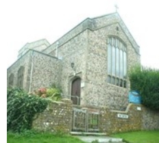
Our Lady of Lourdes

Broad Green/Cowley Drive Woodingdean BN2 6TB