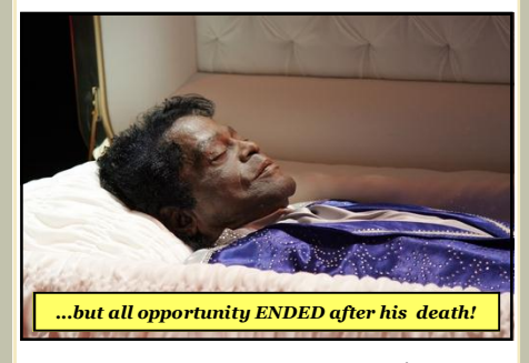
TRUST IN GOD BY FAITH, not PROOF!

If <u>all the souls IN HELL</u> could <u>come out</u> and <u>WARN THE WORLD</u>, <u>they WOULD</u>, but God has <u>MADE THIS IMPOSSIBLE</u>, so that <u>MAN</u> will