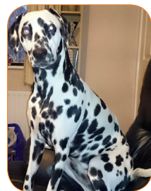
Pixel - Dalmatian