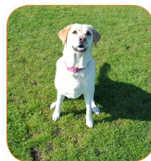
Nala - Golden Labrador