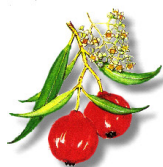
'Quandong' painted by Rosemary Pedler