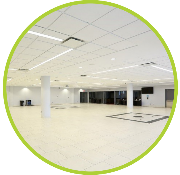
Trade Show Area