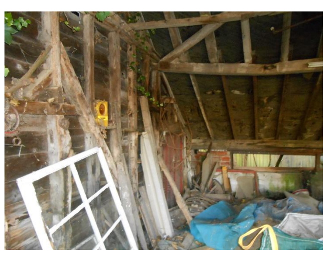
Figure 3 - Interior of barn