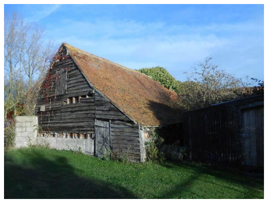
Figure 1- Side elevation of barn

A barn, part of a farmstead on the edge of the beautiful Essex village of Great Totham was looking to be converted into residential use. The local authority had concerns that the structure may be lost, and requested that a record be taken of the original 18<sup>th</sup> century barn, and any later additions.