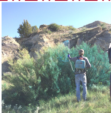
BCWCB Employee treating two different Salt Cedar trees. Southwest of Medora summer 2017.