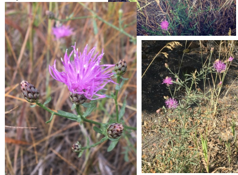
Spotted Knapweed plants located along I 94 North of Medora.

The Billings County Weed Control Board is focused on providing high-quality service and customer satisfaction. “We take pride in helping our local landowners maintain and control noxious weed populations.” We would like to thank everyone involved with the control of noxious weeds in our County!