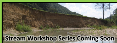
Stream Workshop Series Coming Soon