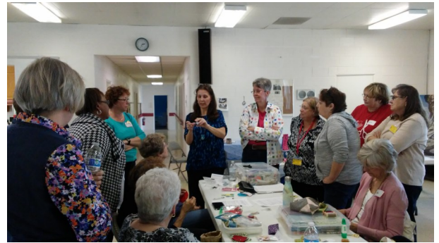
English Paper Piecing Workshop