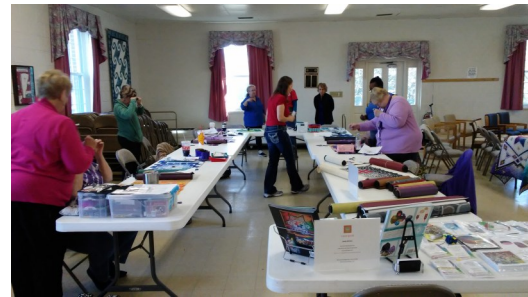
Do you see what I see in this watercolor technique?