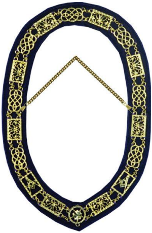
STANDARD GRAND LODGE OFFICER COLLAR ( Purple Backing Gold chain with Grand Emblems) No other Trimmings or Ornaments may be attached - APPOINTED GRAND LODGE OFFICERS