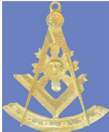
PAST MASTER (Gold)