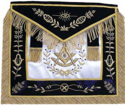
STANDARD APPOINTED GRAND LODGE OFFICER APRON (Purple with Gold Embroidery) No Tau or metal link tabs