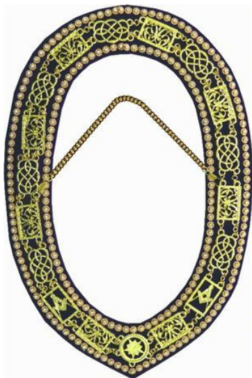
GRAND MASTER / PAST GRAND MASTER COLLAR (Inner/Outer Rhinestone Beaded - Purple Backing)