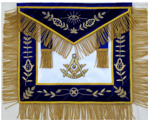
PAST MASTER APRON (Blue with Gold Embroidery NO WREATH )