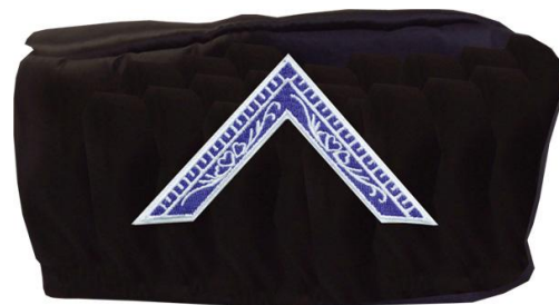
Master's (Brimless) Cap