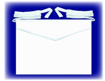
(Funeral / Memorial Apron)

SUBORDINATE LODGE APRONS WITH JEWEL OF OFFICE ARE AN OPTION THE MASTER MASON APRON ABOVE IS ACCEPTABLE FOR ALL MASTER MASONS