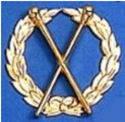
GRAND MASTER OF CEREMONIES