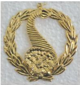
SENIOR GRAND STEWARD