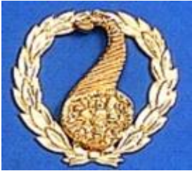
JUNIOR GRAND STEWARD