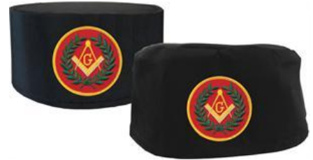
Blue Lodge Crowns