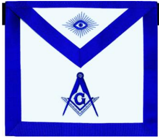
(MM Dress Apron)

Lamb Skin or Cloth. A Fringe of Blue, Silver or White may be added. NO WREATH ON THE JEWELS, NO TABS, NO ORNAMENTAL LILLY WORK, NO TAUS, NO METAL CHAIN TABS