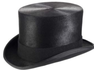
Top Hat (Worn by the Grand Master Only)