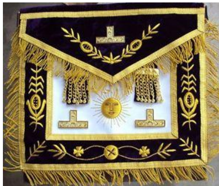
ELECTED GRAND LODGE OFFICER / MWPGM APRON WITH APPROPRIATE JEWEL OF OFFICE (Purple with Gold Embroidery)