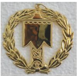
GRAND STANDARD BEARER