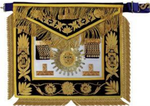
GRAND MASTER (Purple with Gold Embroidery)