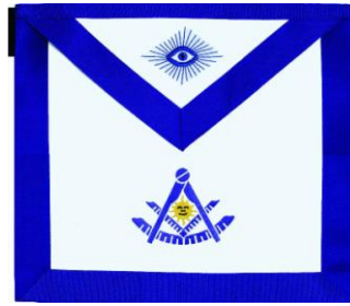
(PM Dress Apron)