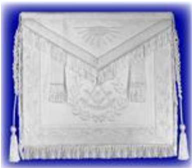
STANDARD GRAND LODGE APRON – FUNERALS/MEMORIAL SERVICES