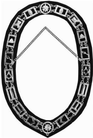
STANDARD SUBORDINATE LODGE COLLAR LOCAL LODGE OFFICERS (Silver Chain / Blue Backing. No other Trimmings or ornaments may be attached excepted the Jewel)