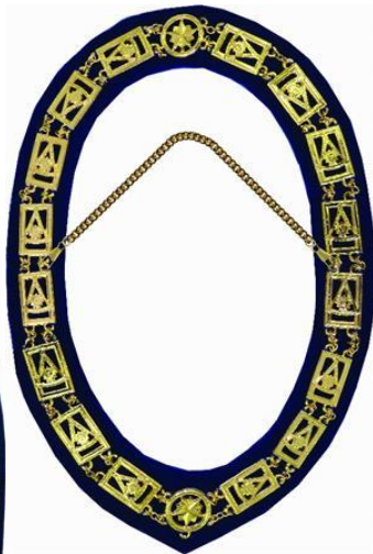
PASTER MASTER COLLAR (Gold or Silver Chain / Blue Backing, No other Trimmings or ornaments may be attached excepted the Jewel)