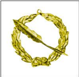
ASSISTANT GRAND SECRETARY