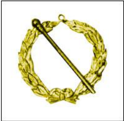
ASSISTANT GRAND MARSHAL