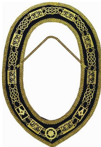
ELECTED GRAND LODGE OFFICER COLLAR (Gold Braid / Purple Backing)