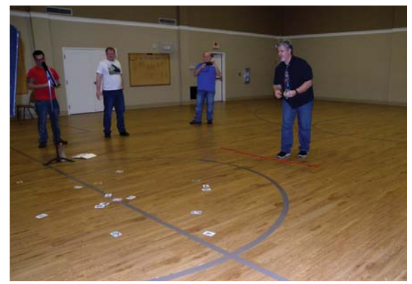
March 2017 - Page 4