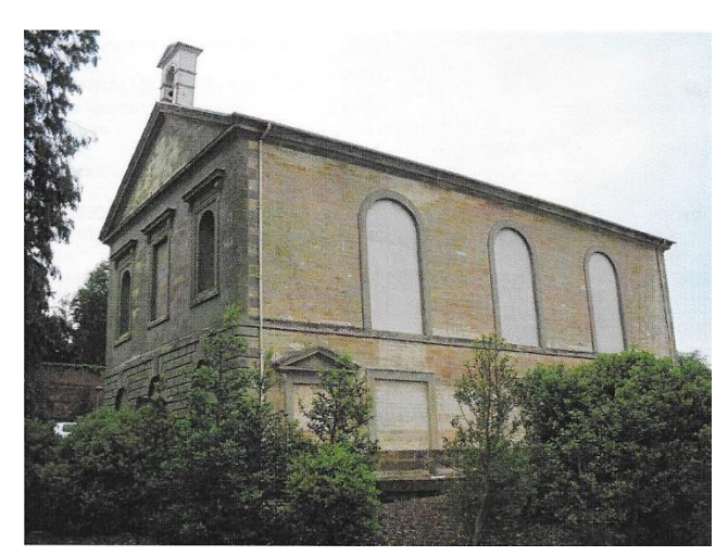
Figure 2 - Exterior of Chapel with windows boarded up