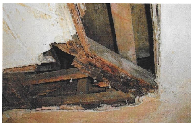
Figure 4 - wet rot due to water ingress due to aged roof covering