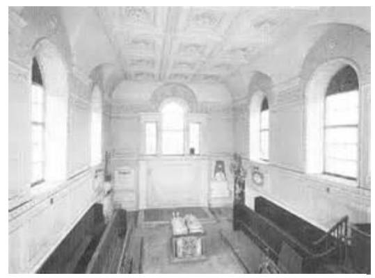
Figure 1- Original Interior

Compton Verney Chapel, is on the site of Compton Verney House which is open to the public as an art gallery.