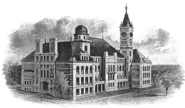
B.M.C. Durfee High School, Fall River, Mass. ESTABLISHED 1888