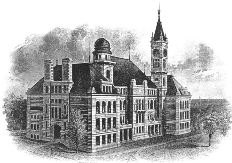
B.M.C. Durfee High School, Fall River, Mass. DEDICATED JUNE 15, 1887

Raise our praises high to Durfee, Alma Mater dear. Tow'ring high beside the river, Radiant beacon clear.