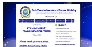
New ETIPM Website "Members' Access" Page