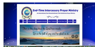
New ETIPM Website Home Page, launched on July 15, 2015