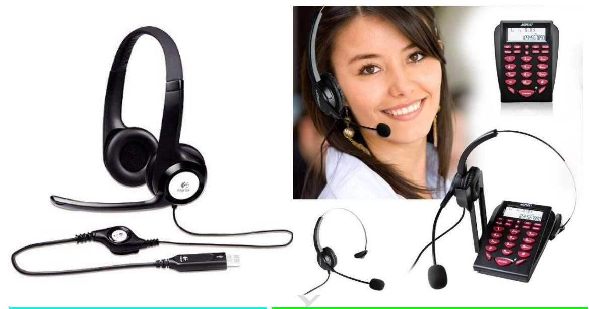
USB Headset needed for class Dial pad Headset needed to take calls

USB Noise Cancelling Headset can be purchased for under $20.00 from Walmart, Best Buy, Amazon or most retailers for computer accessories.