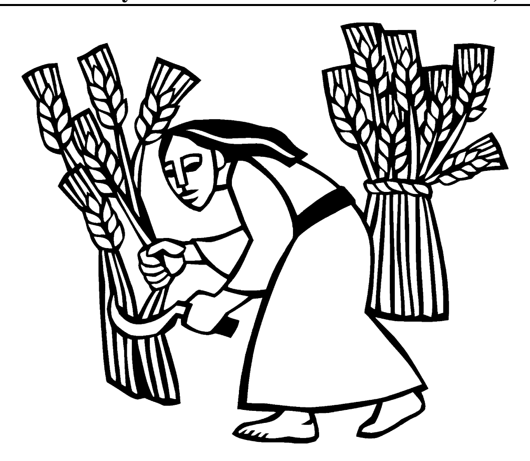
Service of the Word Weekly Resource for Prayer and Devotions at Home