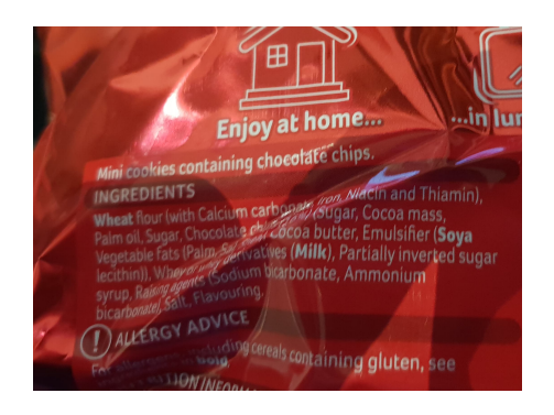
Maryland cookies - allergens MILK, SOYA & WHEAT

-Gluten free & soya free available on request