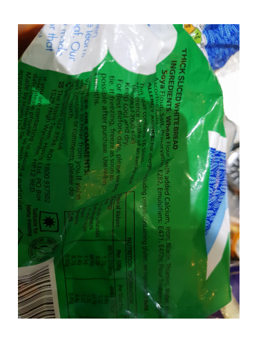
Bread - we use hovis thick