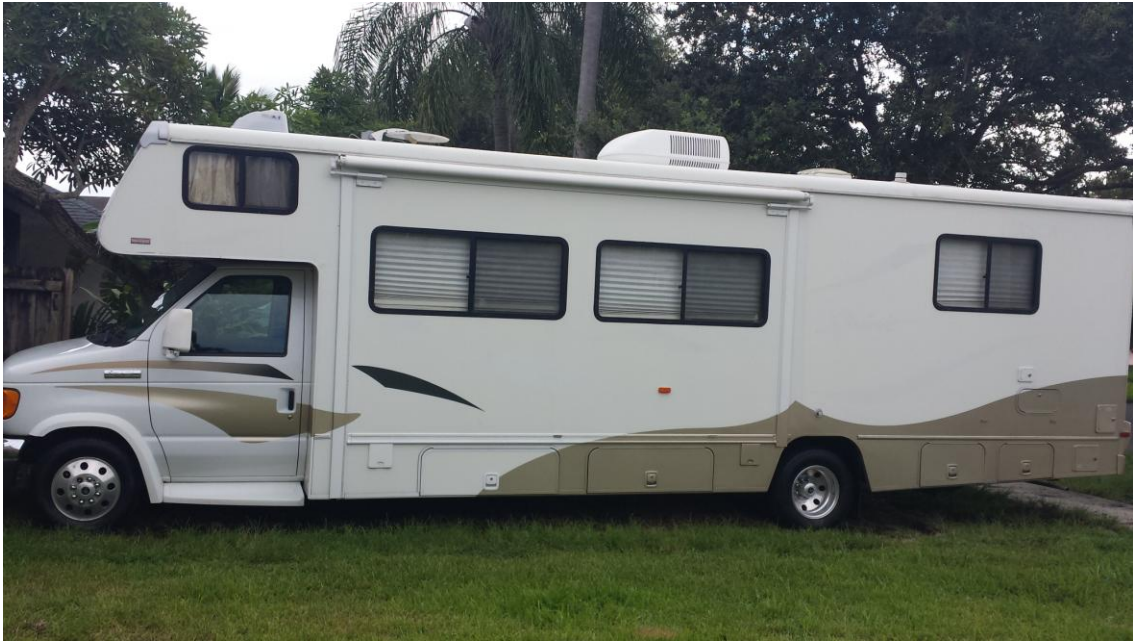
Itasca Spirit 31', Ford E450