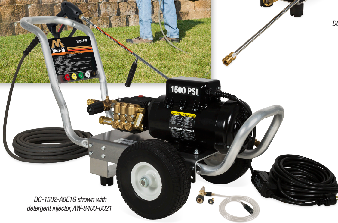
DC-1502-A0E1G shown with detergent injector, AW-8400-0021