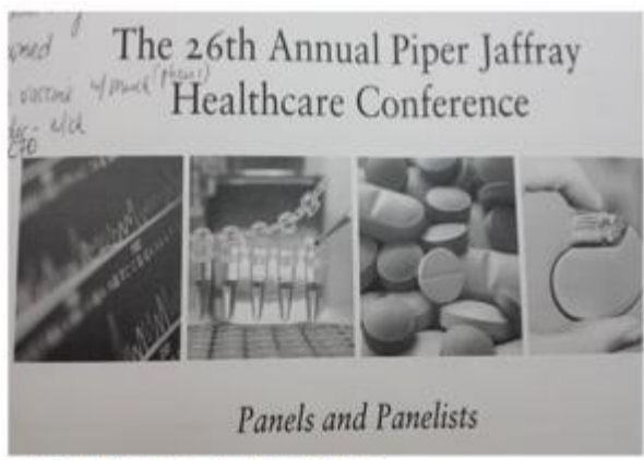
M.L. September - December 2014

First time talking to so many "C's" in 2 days