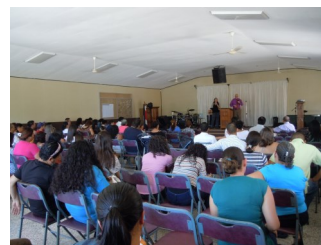
(Continued on page 2)

natural rain, it was a cloud burst in the Spirit. God's presence was so tangible as we ministered in churches, Bible schools, pastors conferences and open-air crusades in multiple communities. We witnessed dozens of salvations, healings and people filled with His Spirit. His ministers were also encouraged and refreshed.