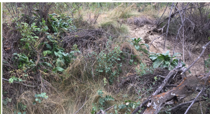
The Houndstongue pictures shown above were taken on an allotment Southwest of Medora.