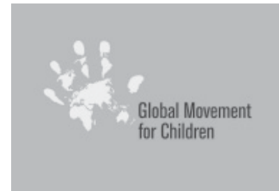
LOGO OF THE GLOBAL MOVEMENT

The results of the campaign will be presented in September 2001 at the Special Session on Children. The Global Movement will then take the message of the Special Session to the world. To get involved in the GMC visit the web sites http://gmfc.org and http://www.unicef.org/gmfc