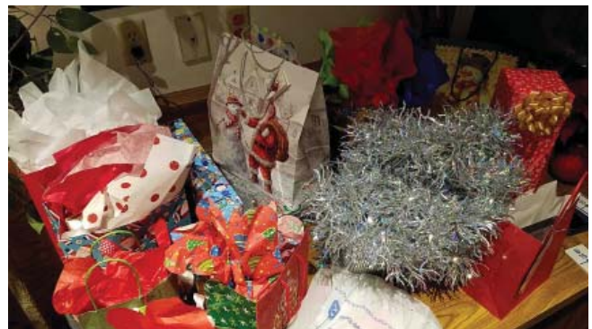
Presents for Annual Gift Swap