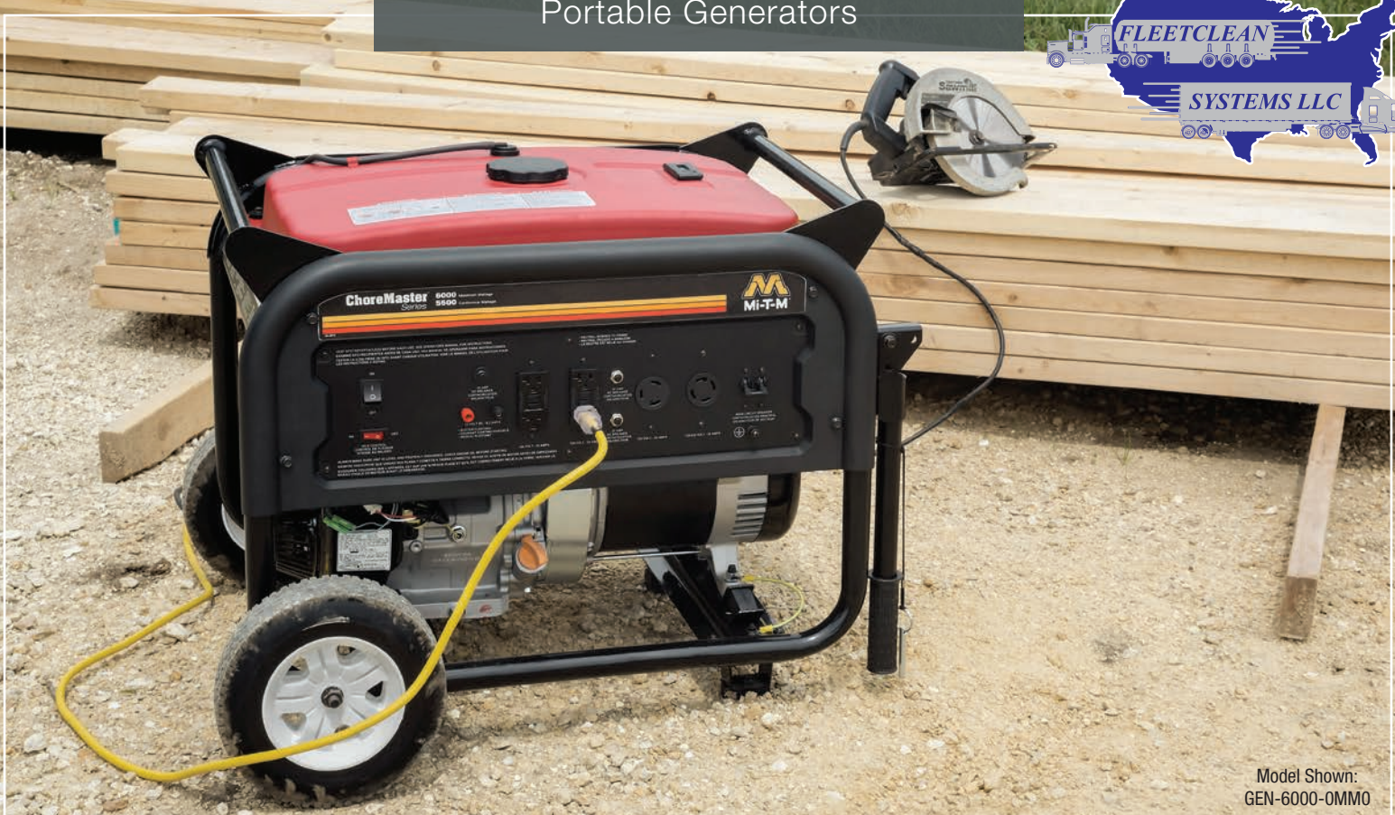
Model Shown: GEN-6000-OMMO