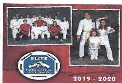
image014.jpg 29 KB