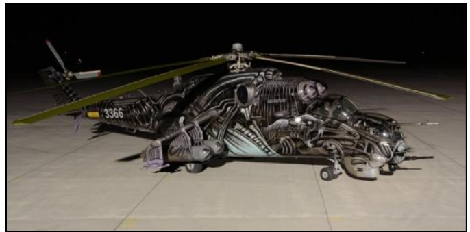
Mi-24 Hind in hybrid alien camouflage

Now we wait for the Veterans Day breakfast to find out who the winner of this year's raffle will be. See you on Friday November 11th between 7-10 AM for the drawing. GOOD LUCK!