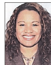
Stanford OFS FITEC LLC