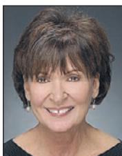
Thomas Institute of Internal Auditors, Atlanta

* Note: The policy of the Atlanta chapter of the IIA forbids running job placement ads from search or recruiting firms.