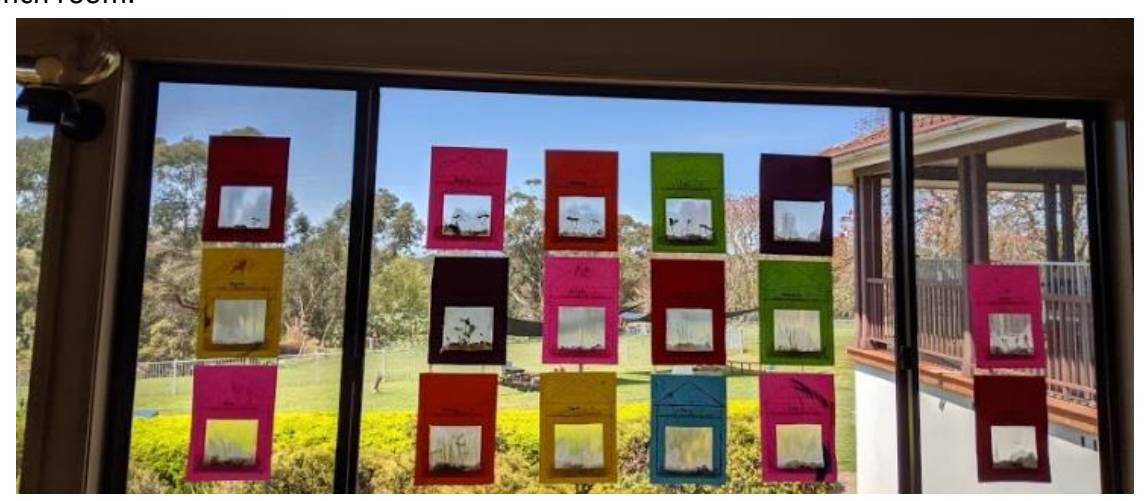
The Lizard room greenhouses thriving on the lunch room window

The children were given the opportunity to make their own greenhouses. They chose between sunflowers and grass seeds to grow. They put the seeds, cotton wool and water in them and have been checking on them we have lunch as they are stuck on the window in the lunch room.